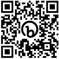
Votes and Ballots