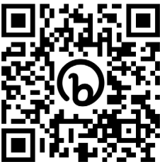
Simulation Resources & Instructions

Simulation Resources & Instructions: https://bit.ly/3coNd9t