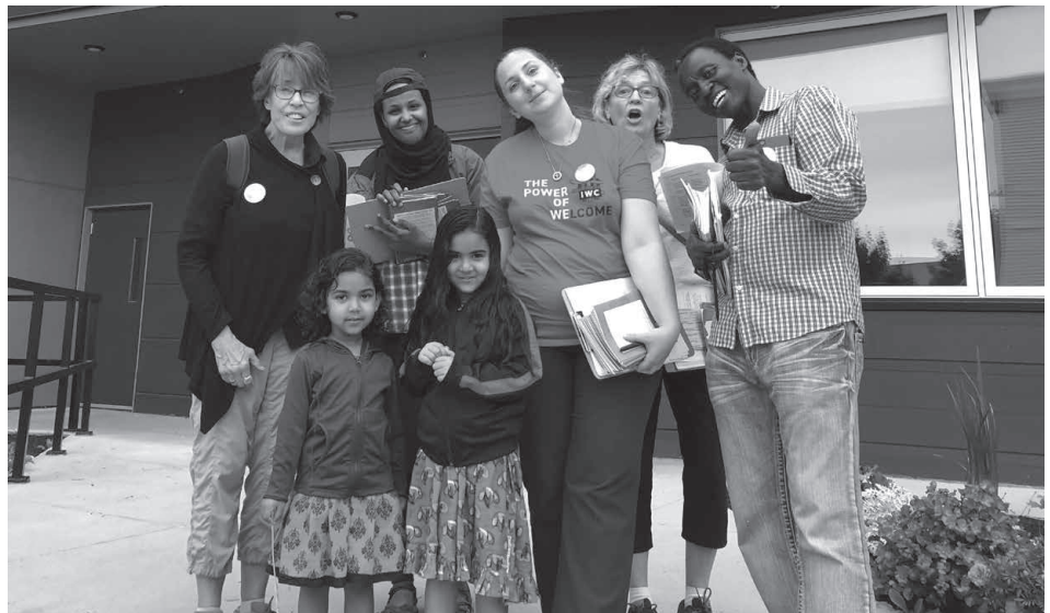
Volunteers registered new voters in the Greater Portland Area in celebration of National Voter Registration Day in September. Want to join future volunteer efforts? Email volunteer@lwvme.org