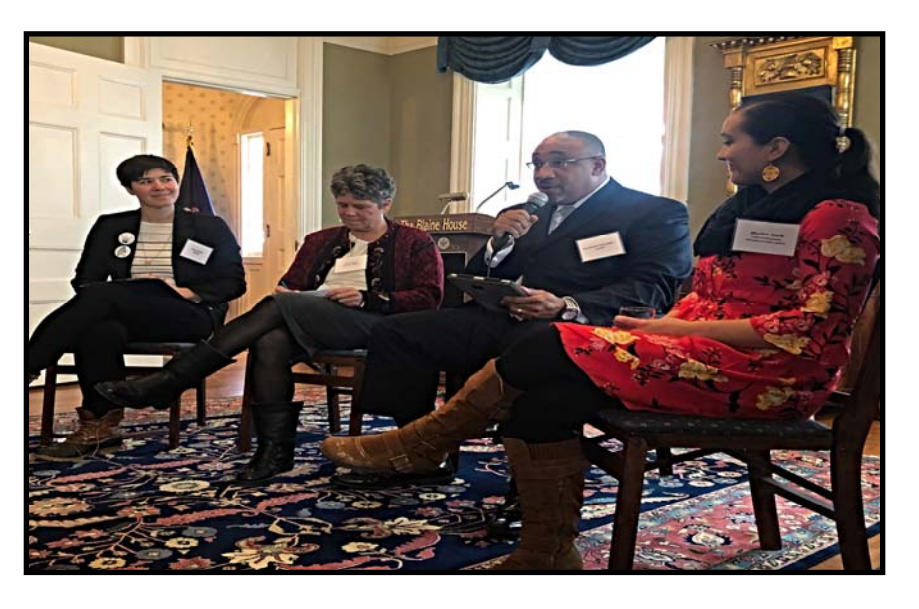
Panelists discuss the history of the struggle for universal suffrage.